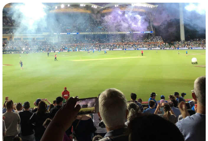
The view from the stands