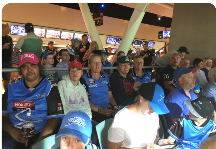
The crew enjoying the Strikers game at Adelaide Oval